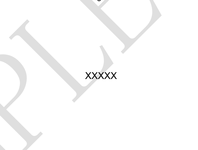
loading view 4