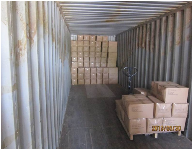
loading view 1