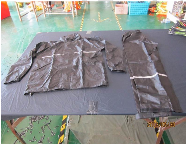
item 34411001 9