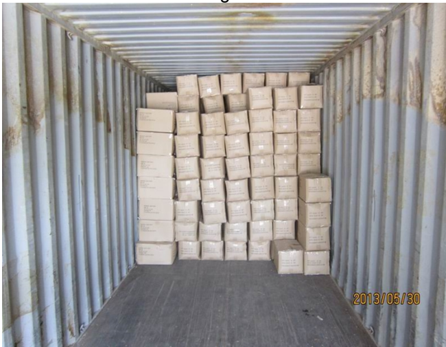
loading view 3