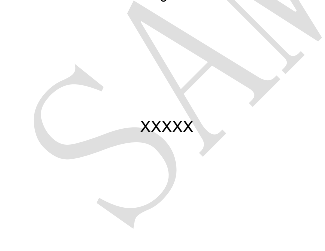
loading view 5