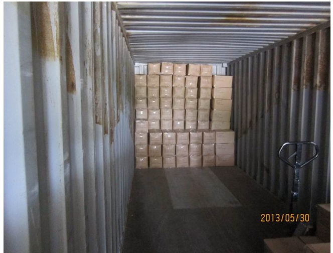
loading view 2