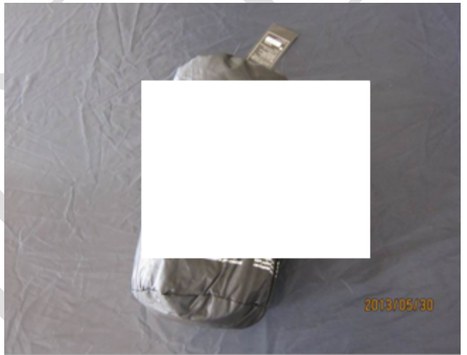
item 34411001 6