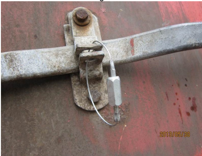
loading view 9