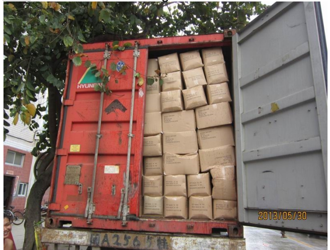
loading view 6