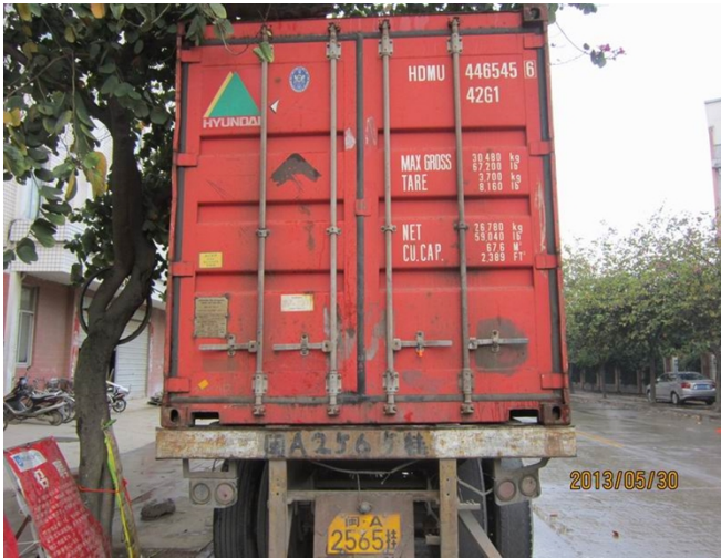
loading view 7