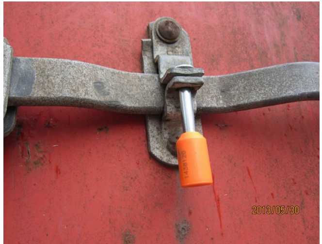
loading view 8