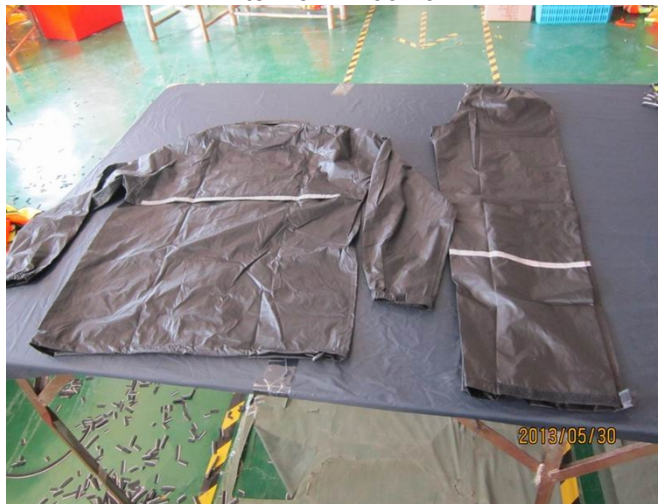
item 34411001 10