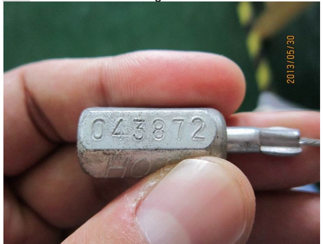
HQTS Seal No