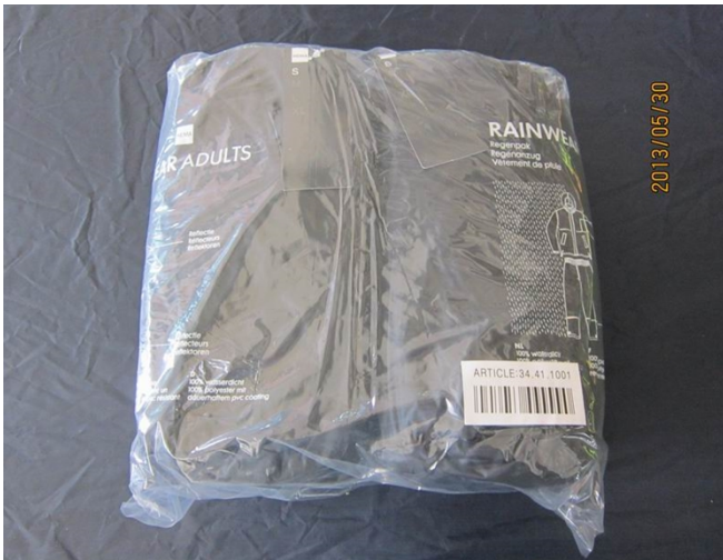
item 34411001 5