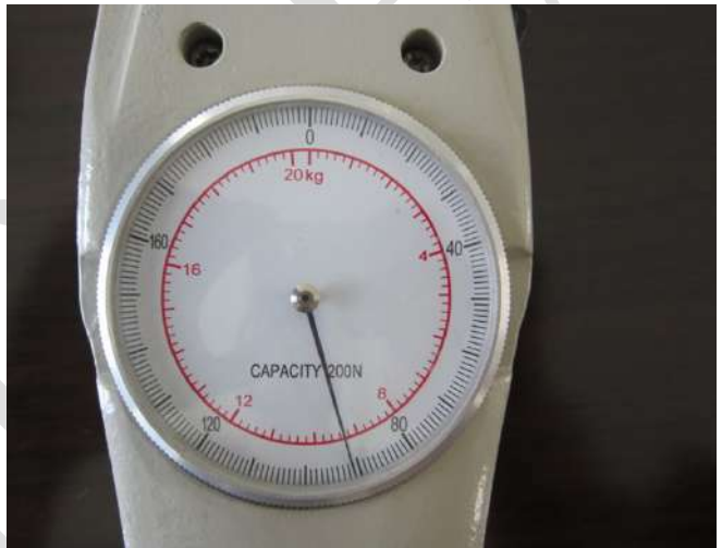
Tension test 2