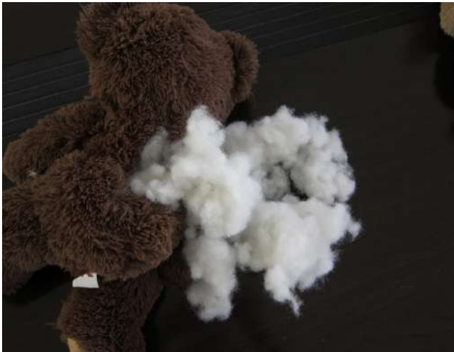
Visual stuffing cleanliness check