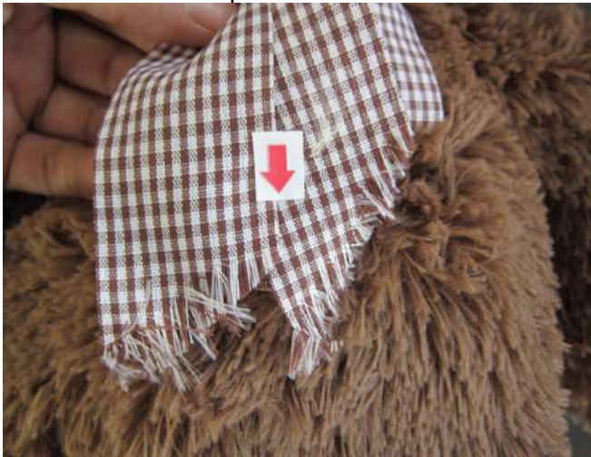
defect- Poor scarf fabric end ma