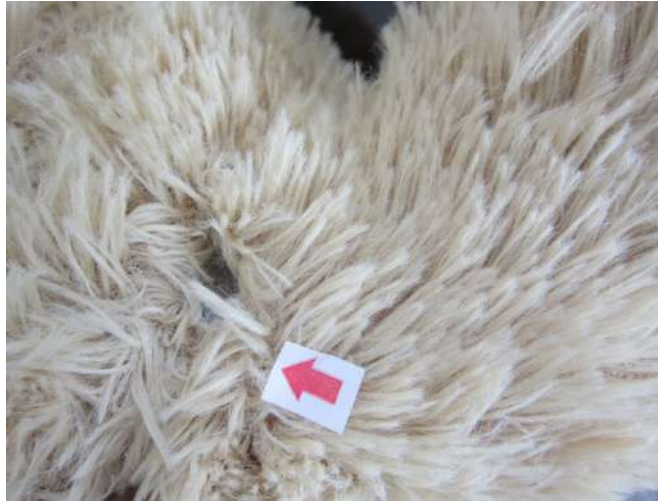
defect-Open seam at unit ma 2