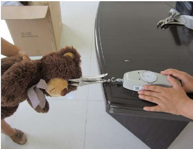
Tension test 1