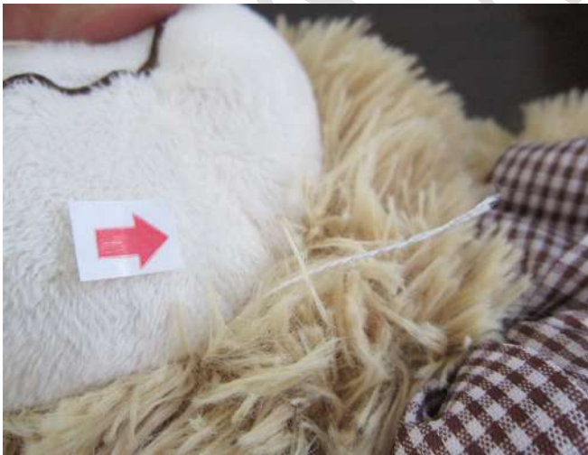
defect-Untrimmed thread end at unit mi 2