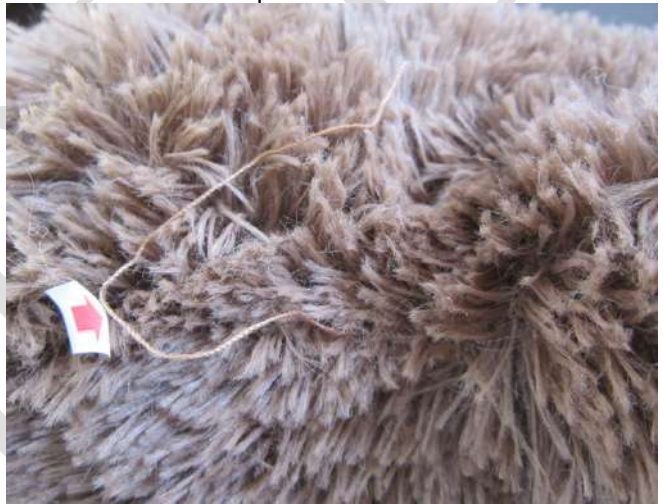
defect-Untrimmed thread end at unit mi 1