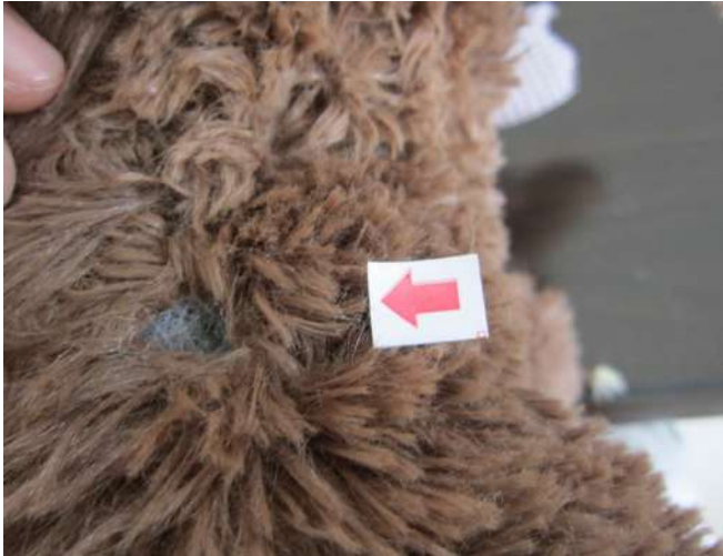
defect-Open seam at unit ma 1