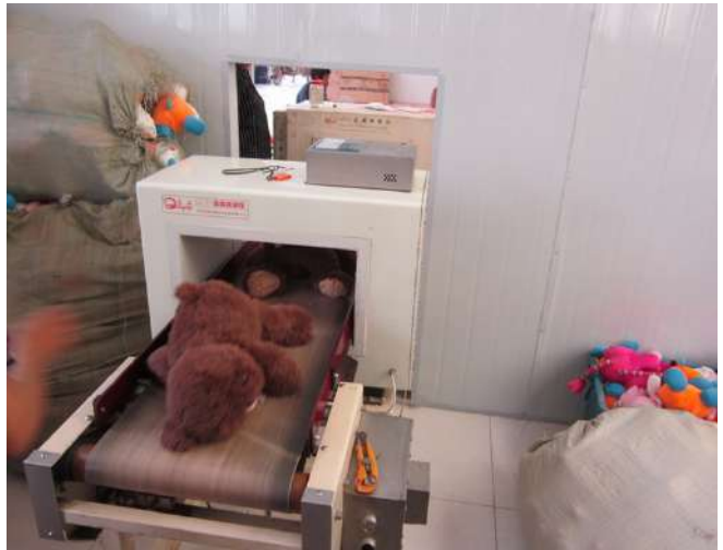
Metal detector test