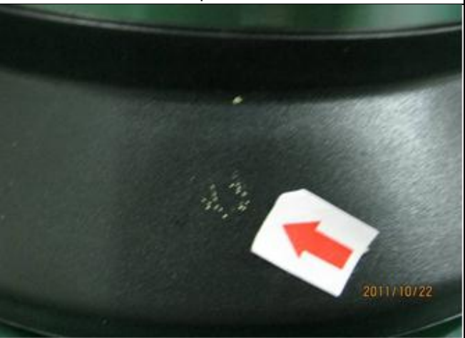
Impurity stain on base plate (removable)