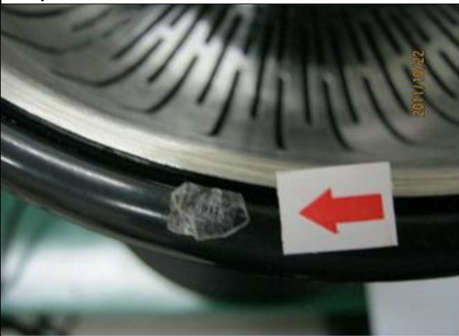
Unknown object sticking on product (look like a piece of gummed tape)