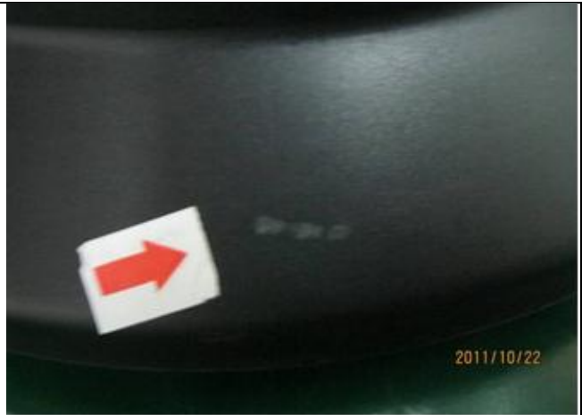
Scratch mark on base plate