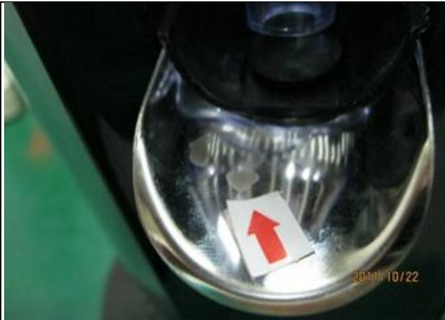
Dirty mark on outlet.